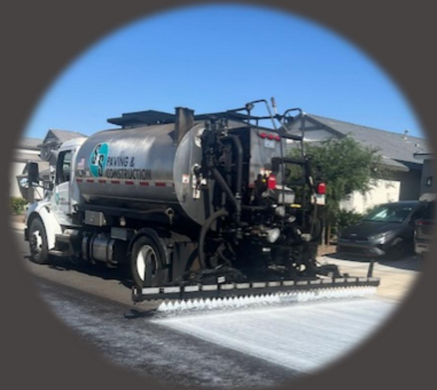
Radiance Subdivision - fog seal May 2026