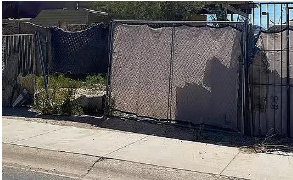
Unpermitted Multi-Material Fence