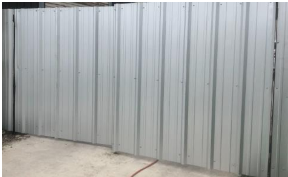
Unpermitted Unframed, Untreated Corrugated Metal Fence