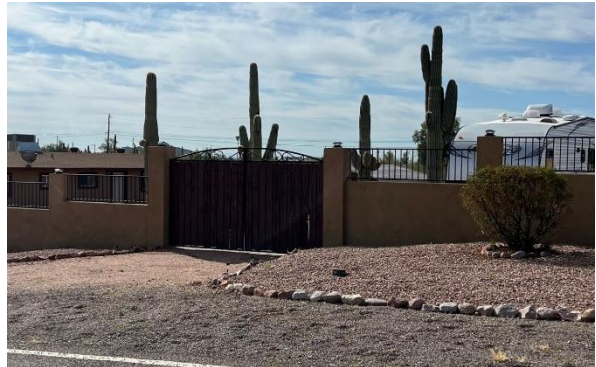
Permitted Multi-Material Fence