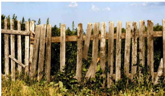
Unpermitted Wood Fence