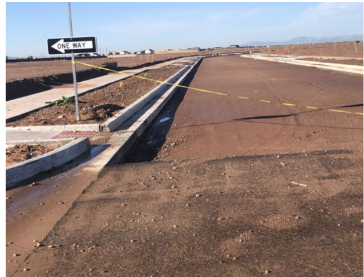
12 – Looking west along the west side.