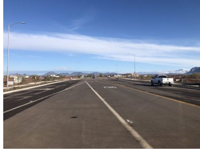
2 – Looking north along Blossom Rock Trail at Ray Road.