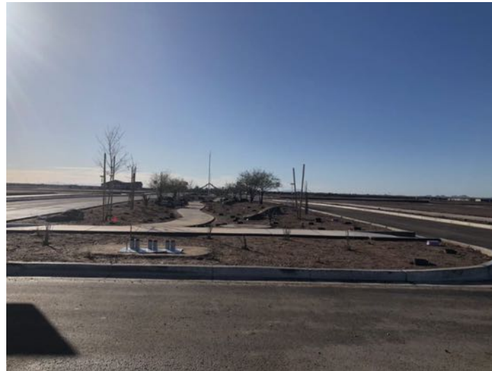
16 – Looking south along Gold Stone Trail from Gold Ore Pass.