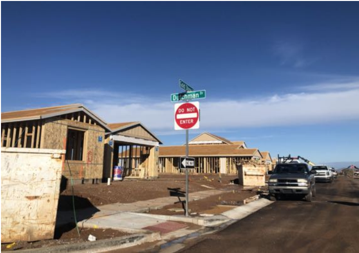
13 – Models at Dutchman Dr and Gold Stone Trail.