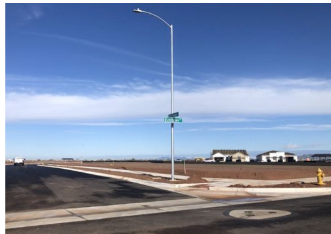
8 – Looking north from Dutchman Drive and Rock Needle Trail.