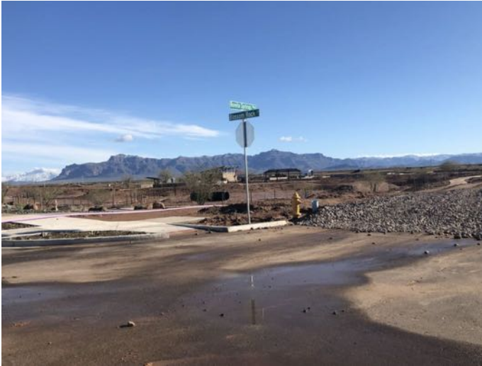
5– Looking NE from Blossom Rock and Bonita Springs Rd.