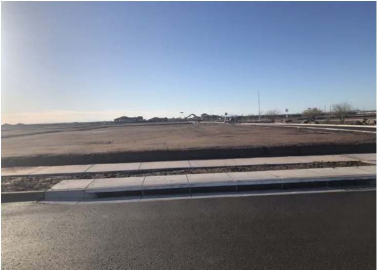
15 – Looking south from Gold Ore Pass at Gold Stone Trail.