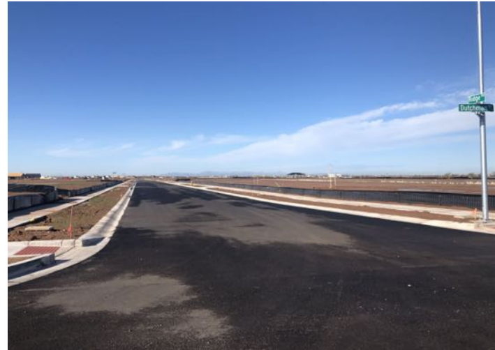
10 – Looking west along Ridge Road at Dutchman Drive.