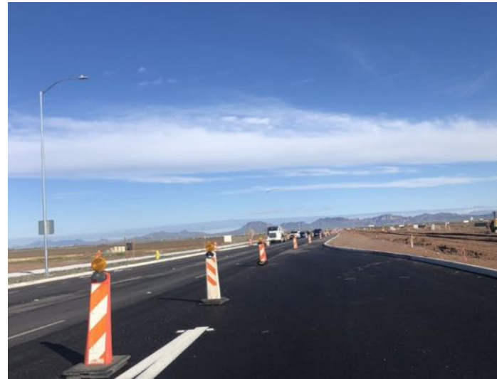
4 – Looking north along Ironwood Drive at Ray Road.