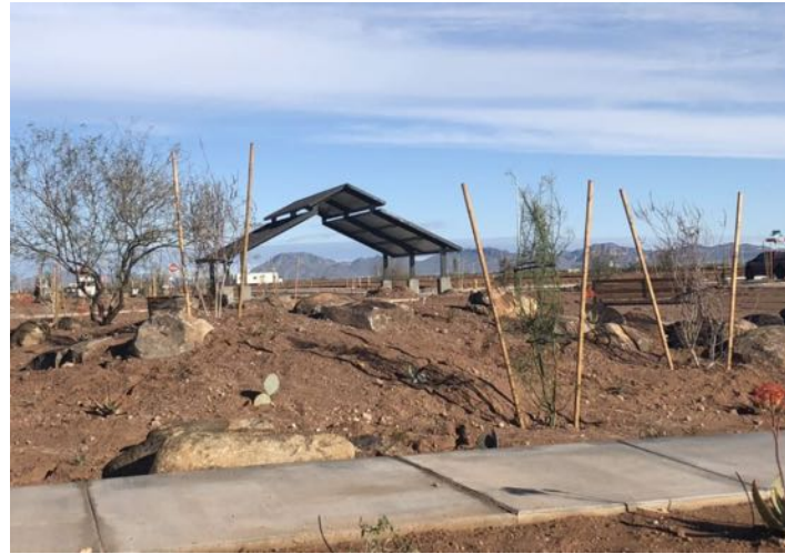
14 – Goldstone Park area.