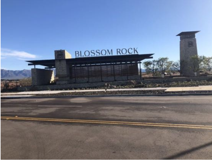
1 – Subdivision entry at Ray Road and Blossom Rock Trail.