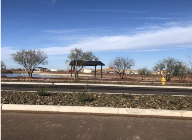
7 – Looking east across the lake area.