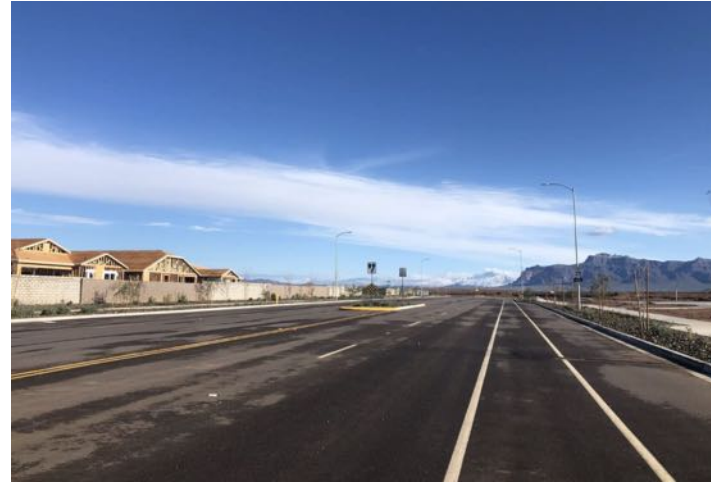
6 – Looking NW on Blossom Rock toward specs on Dutchman Drive.