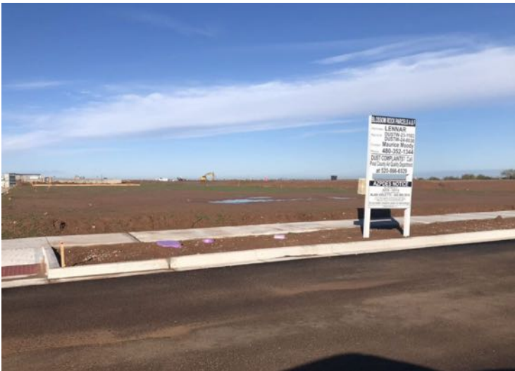
11 – Lennar lots on the west side.