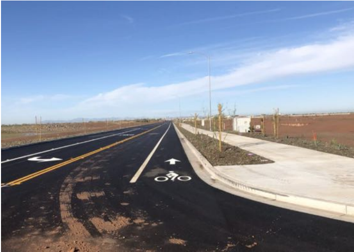
3 – Looking west along Ray Road from Blossom Rock Trail.