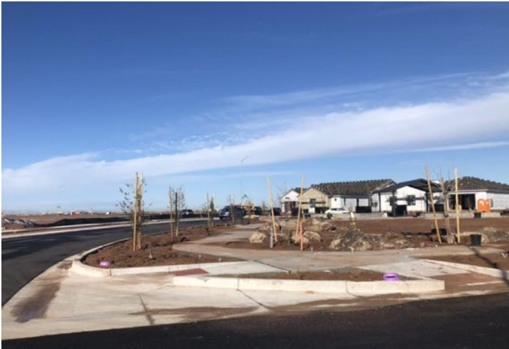
9 – Tri Pointe Models