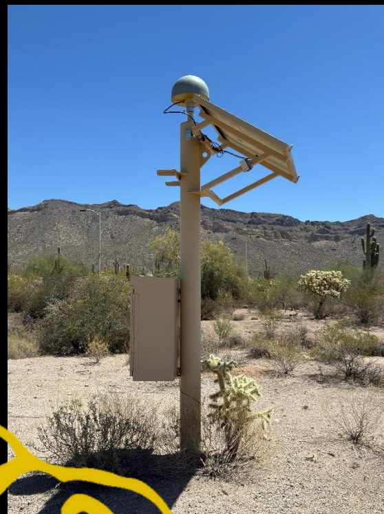
CORS Site @ User Mountain Regional Park