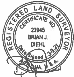
EXHIBIT "A" SUPERSTITION VISTAS D.R. HORTON PARCEL 03/09/2021 WP #205166.01 PAGE 3 OF 4 NOT TO SCALE

EX-RES 08-30-23 Z:\2020\205166\Survey\Legal\5166-L01R01.dwg