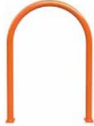
POST AND RING