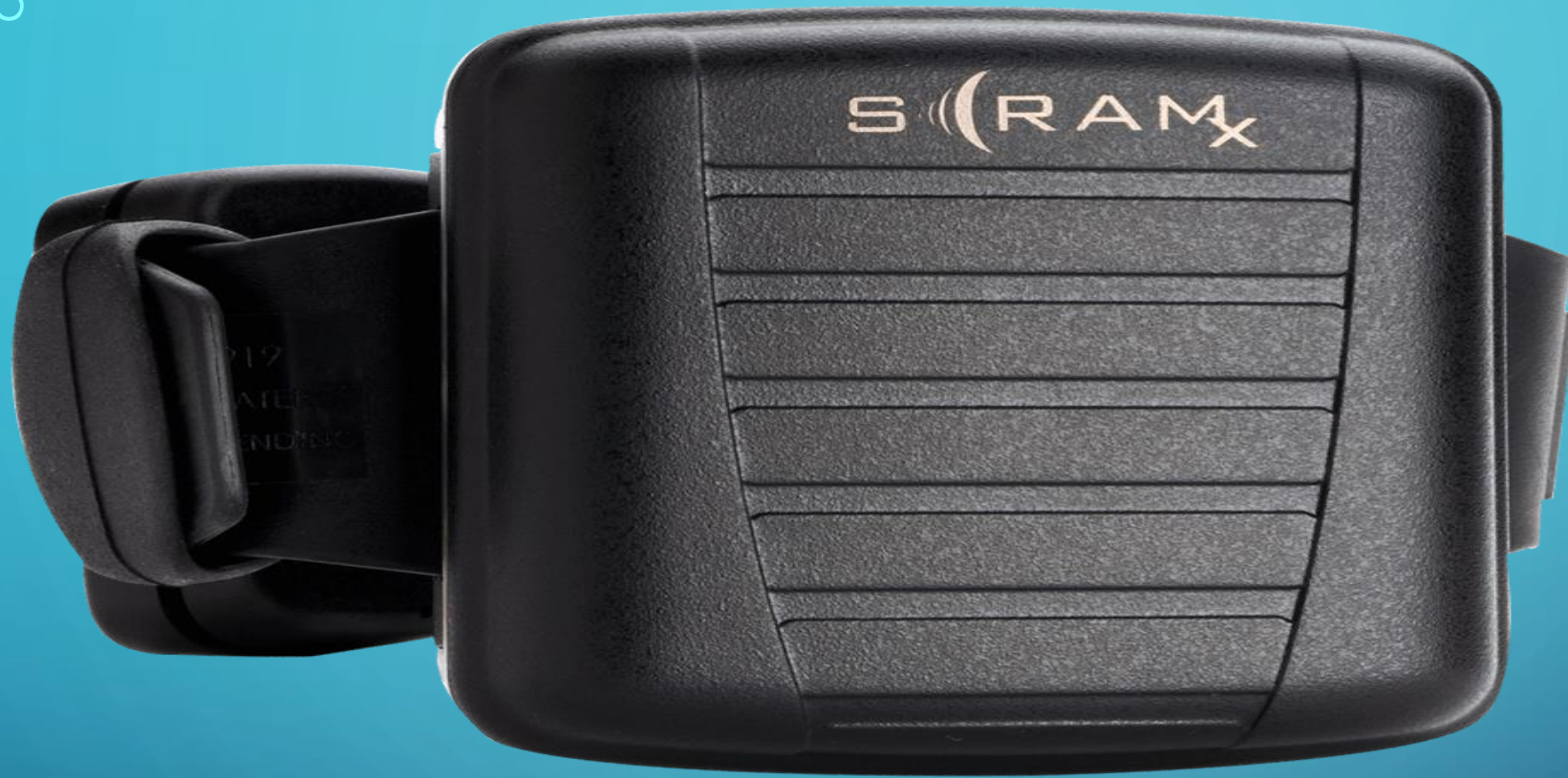
Sample Alcohol Monitoring Device