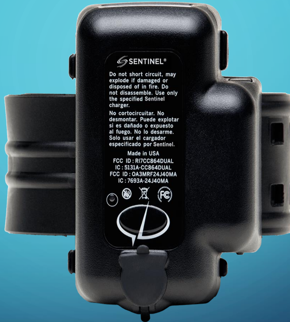
Sample Tracking Device