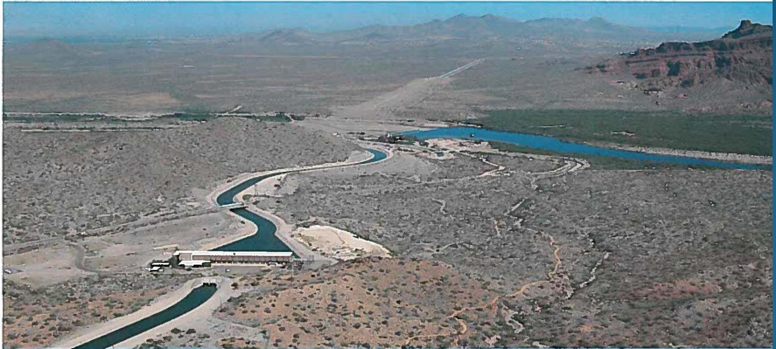
SRP-CAP Interconnect Facility